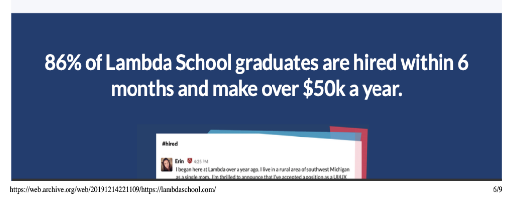
Screenshot from Lambda's website on December 14, 2019.